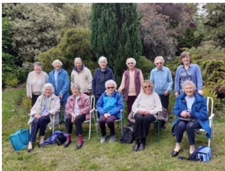
Our Ladies Contact Group bravely ventured out to Upton Country Park recently for a picnic.